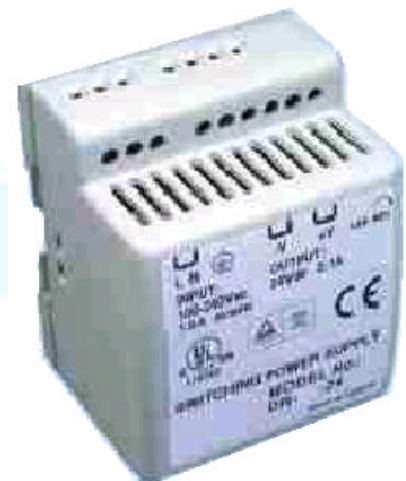
DR4524 93 x 67x 78 mm